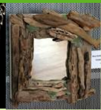
Mirror made from recovered driftwood. By Christie Rottman.

Artists breathe new life into objects. A collection of artists puts their own creative spin on the idea of sustainability at the Main Street Gallery's Green Show. Using everything from horseshoe nails, hubcaps, pastry tube tips, vintage aluminum pencil tops, and more, these artists create stunningly beautiful works from wall hangings to jewelry. Meet some of the artists during a Second Saturday reception 5-8pm, April 10. 413 Muir St.