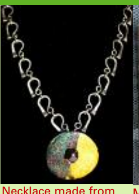
Necklace made from old horseshoe nails and recycled glass. By Armando Suarez.